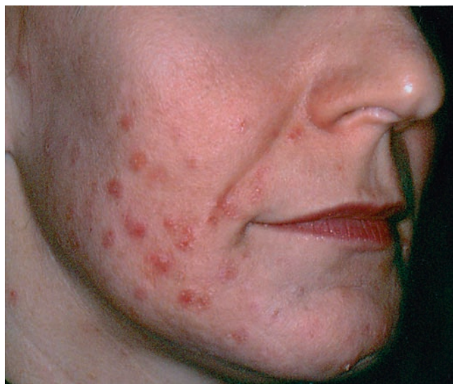
Fig. 2. Patient 2. Monomorphic erythematous papules on the cheeks and throat.

The morphology of the cutaneous lesions in our 2 patients evoked the diagnosis of acneiform eruption, despite the lack of comedos and microcysts. Its unexpected appearance at an age other than adoles-